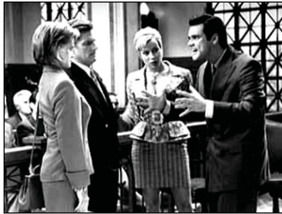
LIAR, LIAR, supra note 60.

Consider, in this regard, the finer-grained depiction later on in the film of Reede's cynical willingness to lie in order to advance his career. In a subsequent scene, we see Reede preparing a female client for trial. It is a child custody case.